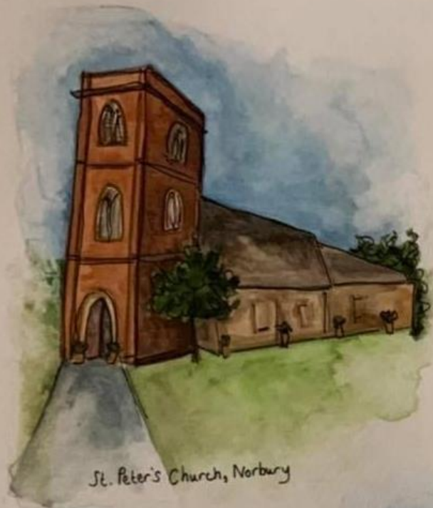
St. Peter's Church, Norbury