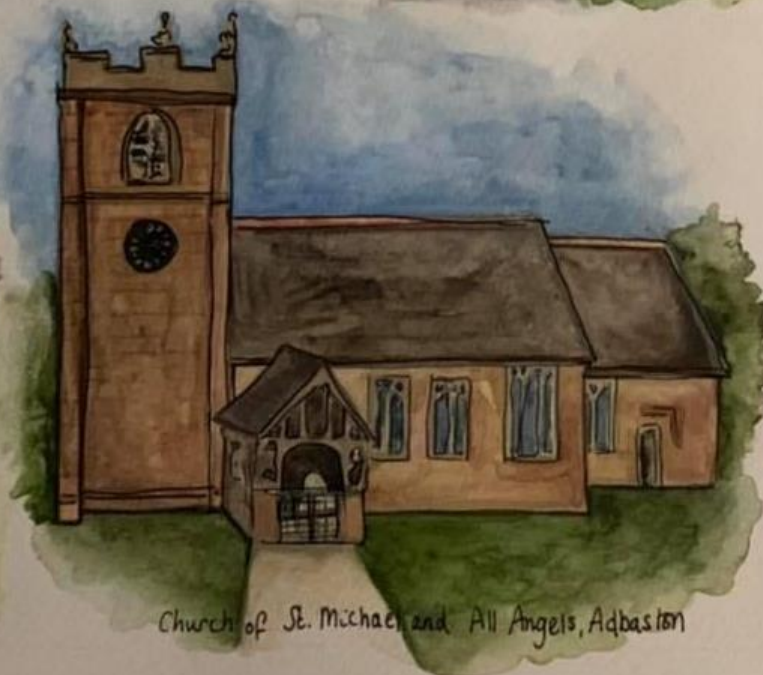
Church of St. Michael and All Angels, Adbaston