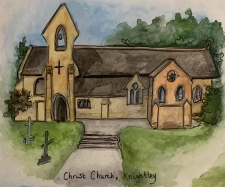
Christ Church, Knightley