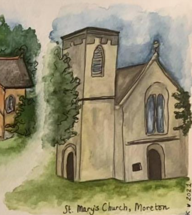
St. Mary's Church, Moreton