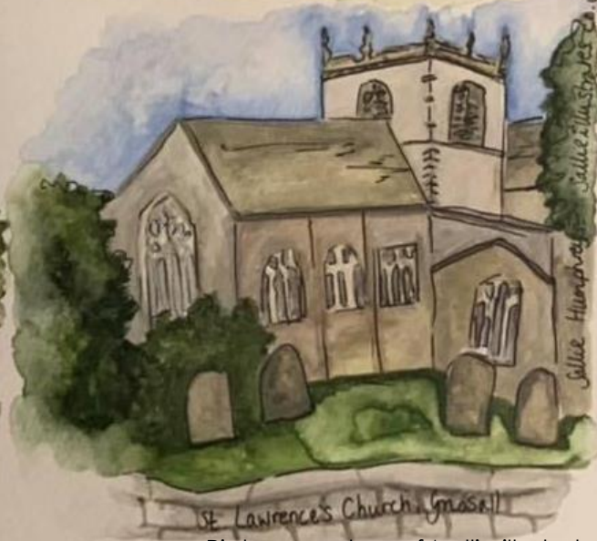
St. Lawrence's Church, Gnosall