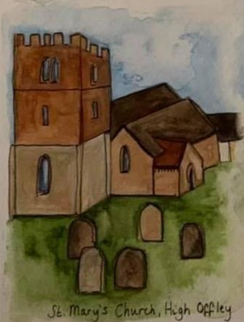
St. Mary's Church, High Offley