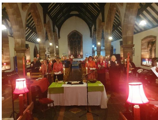
The 2026 World Day of Prayer Service at St Paul's Croxton

We pray that you may sense, in these pages, whether you might be called to join us.