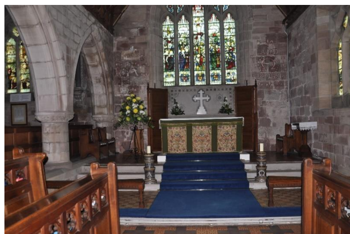
St Mary's Mucklestone - interior showing some of the Kempe stained glass windows

Regular (covenanted) giving is encouraged but, with an Electoral Roll diminishing over time, church income has been dwindling. As in many other walks of life, it will be a challenge to the PCC to meet rising costs. Common Fund obligations are currently paid in full. There are no Parish Trusts or Endowment Funds, but the PCC does have some legacy money, pending decisions on how it is used.