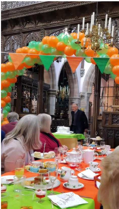
Celebrating 25 years of the Chapter House

On Monday's folks come from miles around for our coffee mornings. With no agenda, just a warm welcome and friendship.