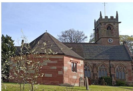
St John's Ashley showing the Chapter House

Our broadband connection enables us to stream all our main services, offer a wi-fi connection to our office computer and others using the church for meetings. Our bi-monthly church magazine takes church and local news to 500 homes in the parish and is printed in-house on our colour copier which also prints Sunday Services Sheets in full for our attending congregation.