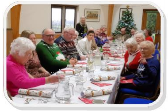
Christmas Feast in the Chapter House

We enjoy a full social calendar with ambitious dinners, bingo, quiz nights and parish parties held throughout the year. These are always fully subscribed and are often enjoyed by folks who have no other connection to the church. This is a lovely way to share the love of God.