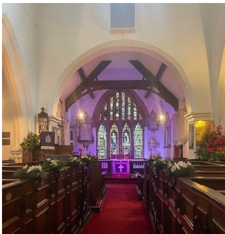
Interior – St Peter's Broughton

The church is Grade I listed and is believed to have Saxon origins, the current building was consecrated in 1633 as a private chapel for the Broughton family, who lived in the adjacent hall and eventually it became the Parish Church. Along with Ashley Church, it features in Simon Jenkins England's 1000 Best Churches. The church escaped the restoring Victorians and remains today in outline the same as when it was built 426 years ago.