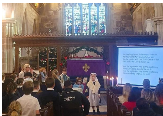
School Christmas Service in church

As in many rural areas, the age profile of our normal Sunday worshippers is predominantly 70+. We look forward to having a Rector who will take an active lead in pastoral visiting, ministering to the elderly as well as the sick and bereaved. And with a very significant number of new houses being built in our parish, we are seeking a Rector who will actively engage in outreach to these newcomers to the area. And with the C. of E. primary school right next to the church, we are seeking a Rector who will build a new focus of outreach to the parents as well as building on our mission with the schoolchildren.