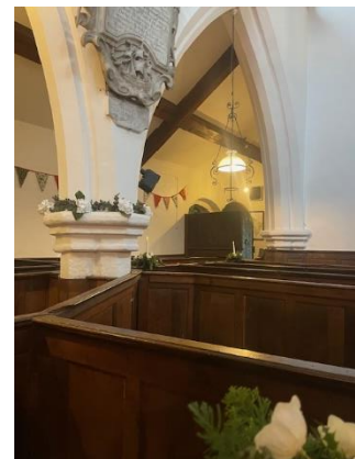
18 th Century Box pews

It has 18th century box pews and some of the finest medieval stained glass in Staffordshire. It also has a very fine peal of eight bells, which attract visiting ringers. The church organ has recently undergone a significant restoration.