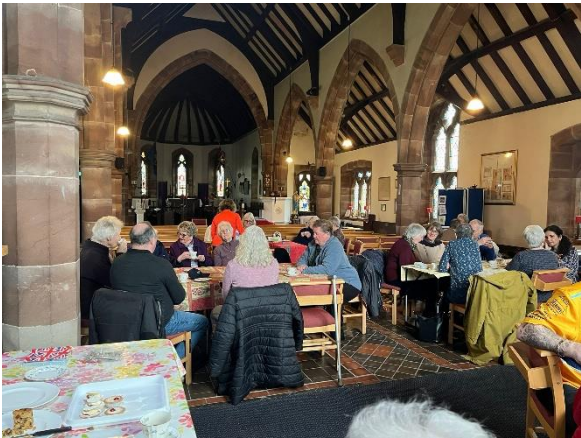
Coffee morning at St Paul's Croxton

This attracts several attendees of the monthly coffee morning, established seven years ago at the request of residents, which serves up to 20 local people. The Associate Minister has introduced an abbreviated monthly Holy Communion service after the monthly coffee mornings, but there is little enthusiasm for this from the congregation.