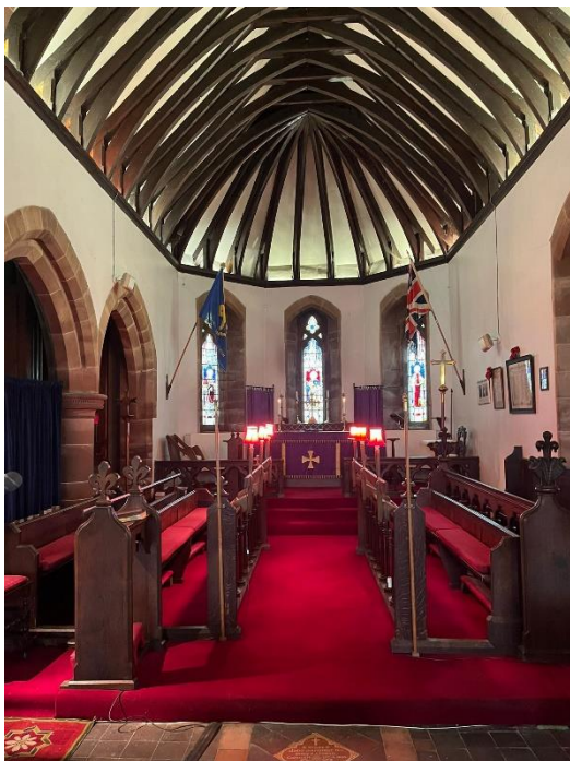
Interior- St Paul's Croxton

The Victorian, sandstone church is Grade 2 listed, dating from 1857. The building is in good repair, having been renovated in 2008, when underfloor heating and radiators; and kitchen and toilet were added.