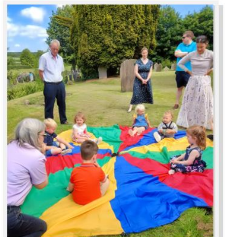
Benefice Baptism Party at St John's

The churchyard surrounds the church and has received good attention from mowers, tidy-uppers and the replacement of a rotten gate which we now call 'The Coronation Gate'. Tightening up of churchyard rules has been met with some resistance but people are enjoying noticeable improvements. A new memorial wall has been in the pipeline for the past three years to bring much needed order to burial of ashes in our Garden of Remembrance.