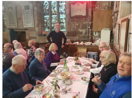
Hearty Soup Lunch in Mucklestone Church hosted by The Friends of St Mary's

Money for maintenance and repairs is being provided primarily as a result of fundraising by the Friends of St Mary's Church, a registered Charity established in the early 1970s specifically for this purpose. Its membership is drawn from the congregation, and they arrange the major parish social and fundraising events, often using the Village Hall in Knighton which provides an excellent venue for the Harvest Supper and Carols by Candlelight. These are joyous occasions, well attended by the local community.