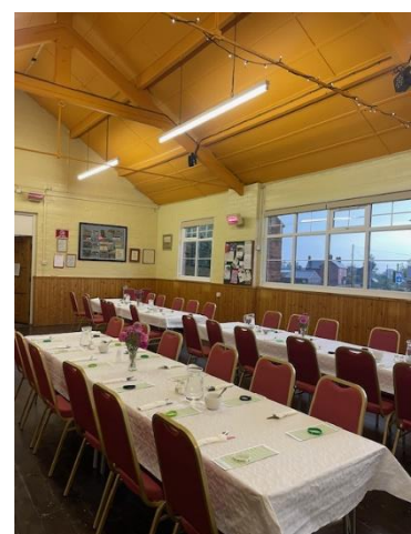
Broughton Parish Room

There is a friendly, informal atmosphere at Broughton Church, and visitors are always made to feel welcome.