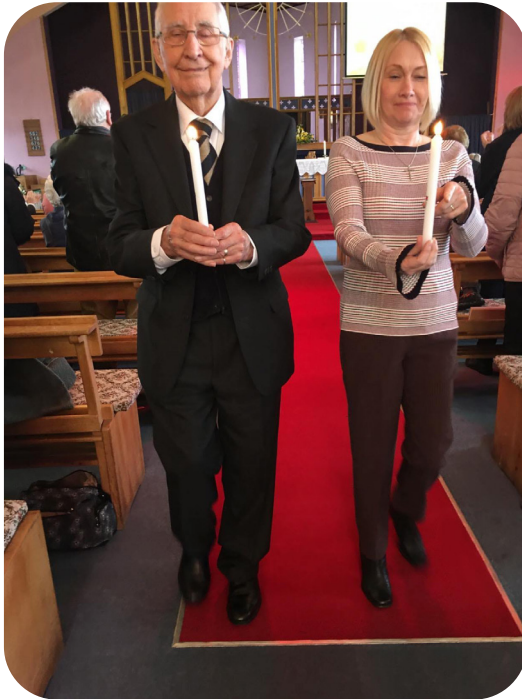
Church of the Holy Spirit, Harlescott