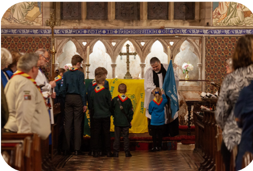
Youth organisations on parade - Hanbury

The Strategic Framework adopted by Diocesan Synod in 2024 yields the ten goals that express or en flesh this trajectory, this vision (a tenth goal, around Net Zero Carbon, was adopted by Diocesan Synod in 2025). Some of the goals contain numbers; these are not meant to be frightening, or strict measures against which a judgement of success or failure will be made. Instead, they are the inspiration, painting a picture of what could be.