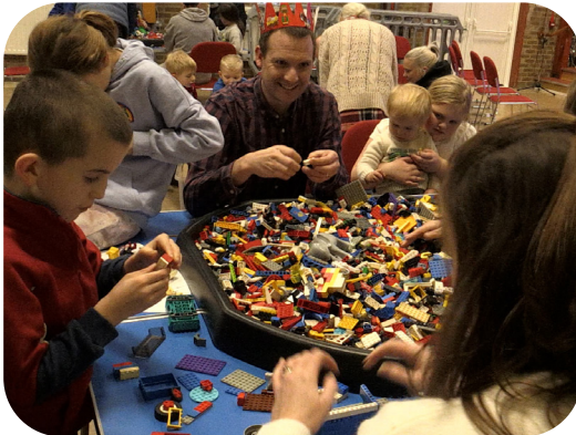
Brick Church - St Thomas, Aldridge