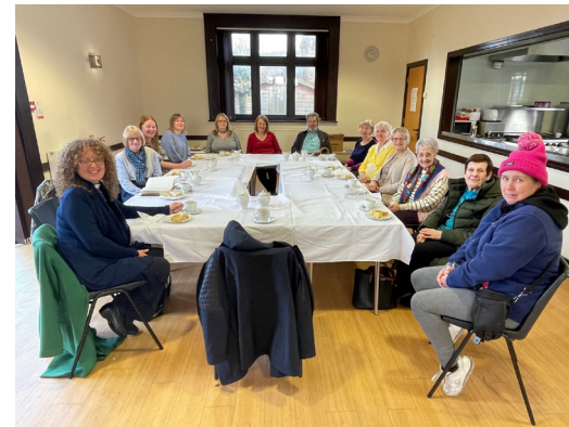
Places of Welcome - Walsall Wood