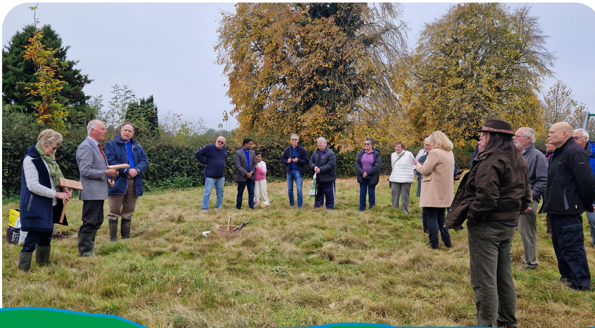
Tree planting - Ellastone