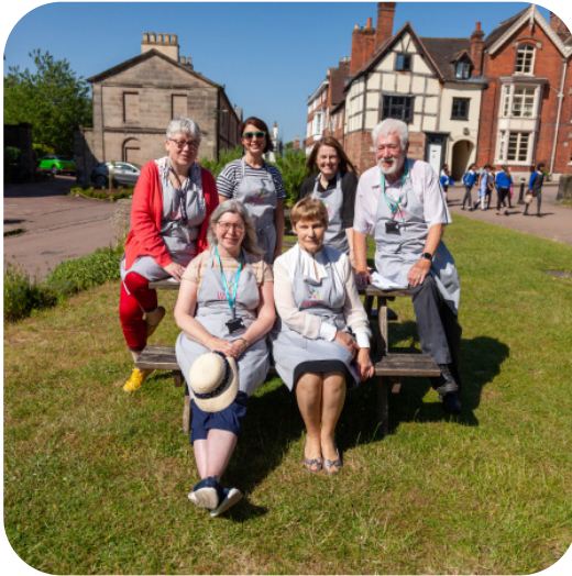
Staff and volunteers with the diocesan education team deliver 'Inspire' to hundreds of school children

There are different kinds of gifts, but the same Spirit distributes them. There are different kinds of service, but the same Lord. There are different kinds of working, but in all of them and in everyone it is the same God at work. (1 Corinthians 12:4-6, NIV)