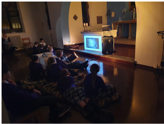
Chaplaincy - Ellesmere College