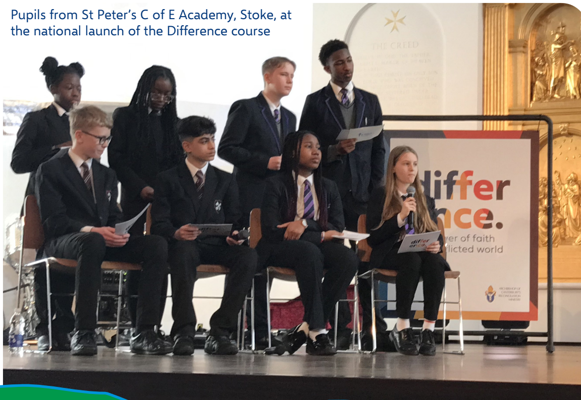
Pupils from St Peter's C of E Academy, Stoke, at the national launch of the Difference course