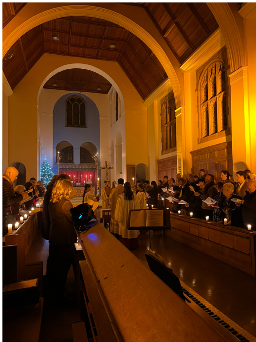
Chaplaincy - Ellesmere College