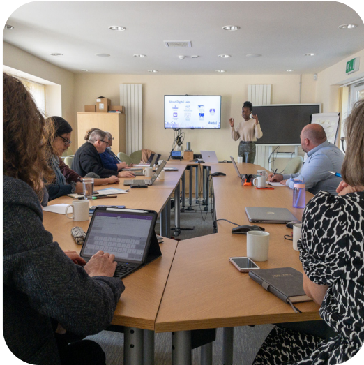
A seminar on the latest in social media delivered by the national CofE to diocesan staff

Focus is aided in two ways both of which address the issue of 'noise'. Noise happens when communications from the same organisation, or what is perceived by audiences as the same organisation, overlap either in time or content, or are too frequent! The message doesn't get through because it is not heard distinctly, or it is ignored because of overload. It's not the messages. Or the audience. It can be lack of planning and co-ordination. The creation of false expectations or lack of attention to how people give attention to things and why. The other source of noise is information overload, where everything received for dissemination is passed on without discrimination or discernment.