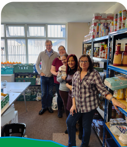
The Food Bank - Chell Parish Church

We need a pipeline of lay and ordained leaders for the future: the diocese has more than 400 parishes and more than 200 benefices, each of which needs