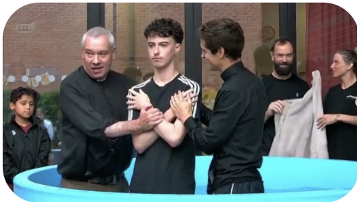
Baptisms at Aldridge Parish Church

Through our focus on Feeding our Faith , Supporting our Ministry , and Building up our Parishes and Communities we address our missional challenges and are free to journey together towards our vision.