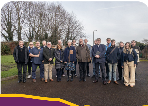
Clergy of the 'larger churches' network meeting in Lichfield

We need to take care of those who carry the weight of leadership in our diocese, especially in the most demanding of times. Our strategy is to ensure that all who exercise frontline ministry, and especially those in incumbent-level ministry and those leading worshipping communities, are enabled to flourish as human beings.