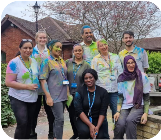
Anglican and other chaplains at Black Country Healthcare NHS Foundation Trust