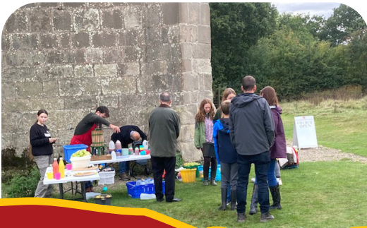
Forest Church service at Battlefield in the Severn Loop parishes

All people are created in the image of God and are equal in dignity and value. Our strategy is especially careful to ensure that people of all ages and from all different backgrounds are enabled to flourish as disciples.