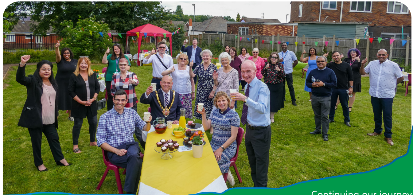
The Big Lunch - Bradley

By praying together, feeding and supporting one another as followers of Jesus, by building one another up we can reimagine and revitalise our ministry, and as a diocesan family we can journey together.