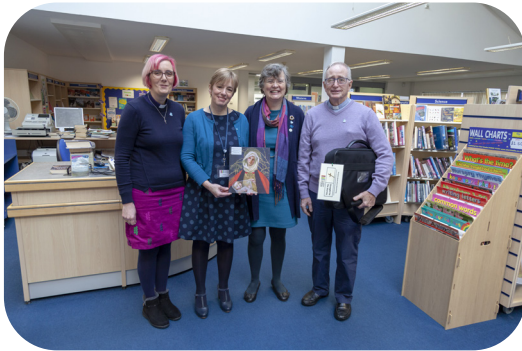
Ellesmere Deanery was the first in the country to have a full house of Dementia-friendly churches and offer support via the local library