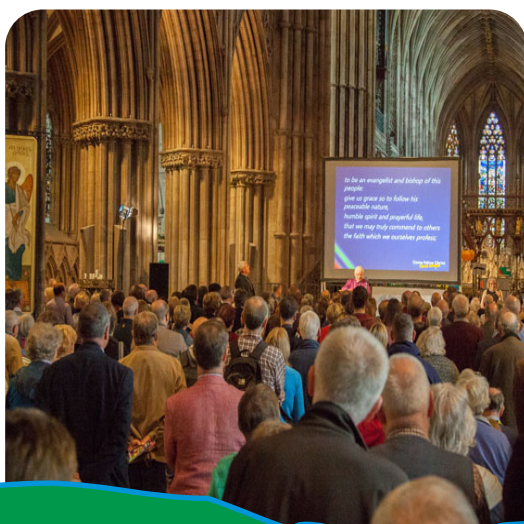
'First Steps' - Lichfield Cathedral 2017