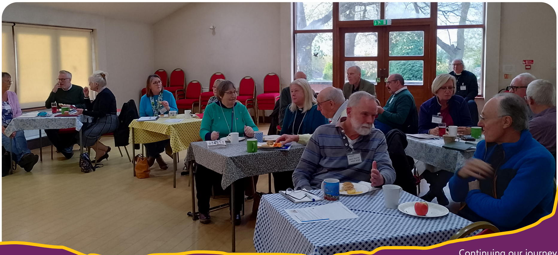
Churchwardens from around the diocese meeting for mutual support