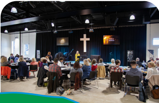
New meeting space at Telford Minster resource church

'Continuing our Journey' published by Lichfield Diocesan Board of Finance. Spring 2025