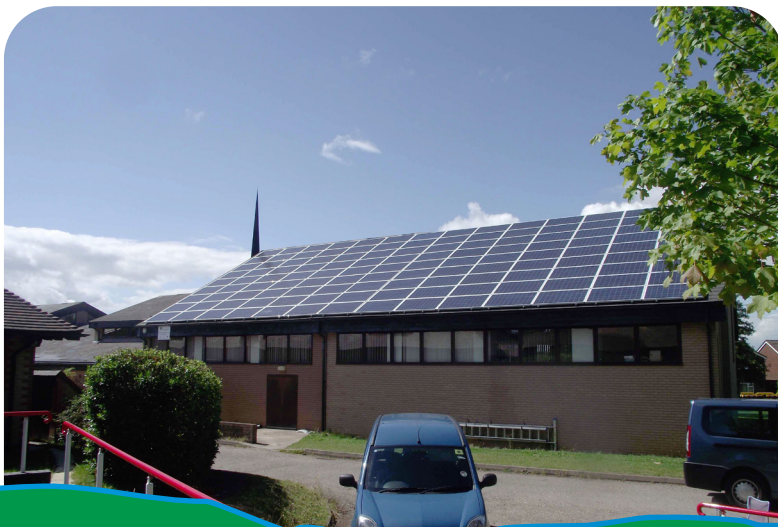
Solar power at Christ Church Bayston Hill

The Church of England is committed to being Net Zero Carbon (NZC) by 2030: for our diocese this includes our 550 churches (many with church halls), 206 schools, 300 houses as well as our cathedral, two retreat centres and our staff office.