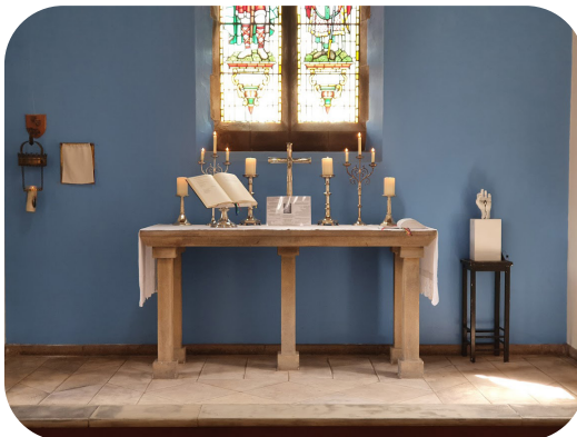
Chaplaincy - Ellesmere College