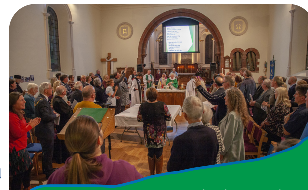
Clergy licensing at Wrockwardine Wood, Telford