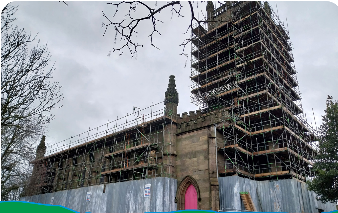
Major works at St Mark's Shelton during 2023-5

Buildings: the condition of nearly 200 of our church buildings was identified as being of concern in a recent audit.