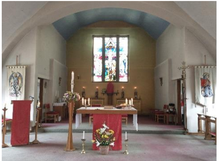
Altar at St Michael's

It is hope that a suitable pattern of daily worship might be introduced across the churches.