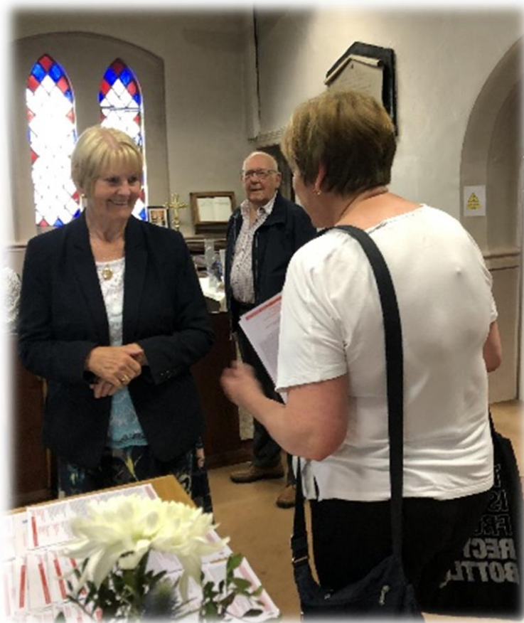
A warm welcome at St John's

We are calling this a Missionary Society model.