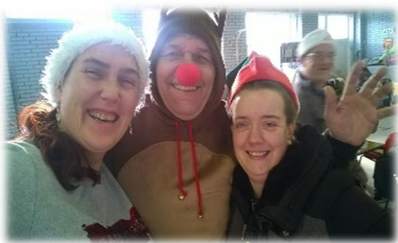
Christmas fun at St Mark's

All three parishes share the same recent experience. Older worshippers have died or are now unable to attend, whilst all the churches have also gained new members who are younger and much more ethnically diverse than previously was the case, including, amongst others, people of Polish, Albanian and Portuguese heritage as well as Afro-Caribbean and others. New members are typically younger, including children and some young adults.