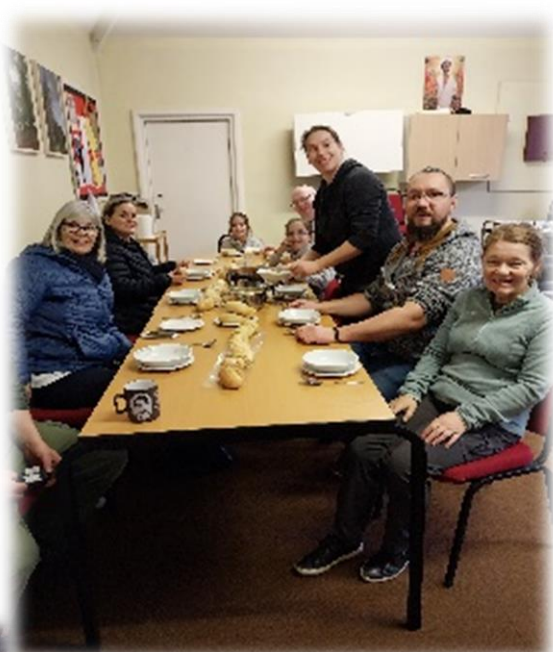
Fellowship in Tividale